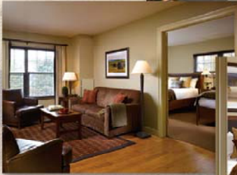
Former Hawthorn Suites - South Burlington